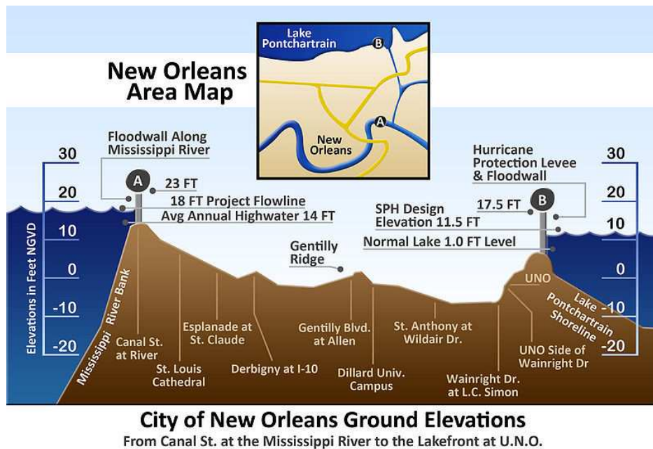
Figure 2. Location of New Orleans in relation to Mississippi River and Lake Pontchartrain (4)

Hurricane Katrina in 2005 had a devastating impact on the city, causing the failure of the levees and floodwalls that protect it and creating the worst civil engineering disaster in American history. As a result of the hurricane, 80% of New Orleans was flooded, and across Louisiana 1,500 people lost their lives, 900,000 people were displaced, 16,000 businesses were flooded and forty schools were destroyed, with majority of the losses and damage occurring in New Orleans itself (3) .