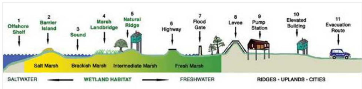
Figure 3. Multiple lines of defence against hurricanes, flooding and sea rise, including wetlands (7)

A major lesson of Hurricane Katrina is that New Orleans cannot simply rely on bigger or better levees, gates, and pumps for flood protection. The city must adopt a strategy that addresses multiple lines of defence (Figure 3), some of which will require continued advocacy and vigilance, and some of which the city and its citizens can take charge of themselves. The multiple lines of defence range from restoration of coastal wetlands, development of hard infrastructure, and non-structural strategies such as land use and building codes, and enhanced emergency preparedness (7) .