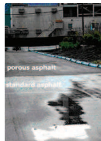
Above: Standard asphalt traps water on the surface – porous asphalt allows water to penetrate